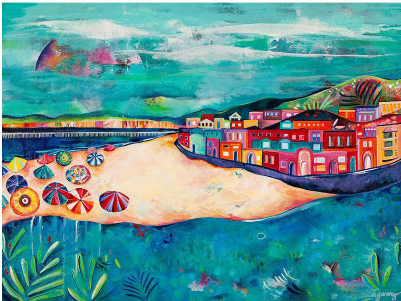
Capitola Art & Wine Festival Sept. 14th & 15th - capitolaartandwine.com - Poster Artist: Andrea Garvey