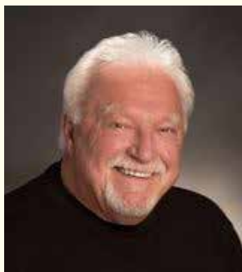
Santa Cruz Homegrown