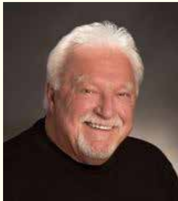
Santa Cruz Homegrown