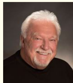
Santa Cruz Homegrown

914 1/2 Seabright Ave. Santa Cruz CA 95062 $2,300,000 245 Dickens Way Santa Cruz CA 95060 $474,000 214 Pelton Ave. Santa Cruz CA 95060 $1,795,000 1811 Mission St. Santa Cruz CA 95060 $920,000 424 Harbor Dr. Santa Cruz CA 95062 $1,780,000 3206 Stockbridge Lane Santa Cruz CA 95062 $739,000 121 Palomino Way Santa Cruz CA 95060 $2,250,000 770 Crystal Lane Santa Cruz CA 95062 $1,638,000 116 Walk Circle Santa Cruz CA 95060 $515,000 218 2nd Avenue Santa Cruz CA 95062 $1,600,000 2600 17th Avenue Santa Cruz CA 95062 $1,550,000 450 8th Avenue Santa Cruz CA 95062 $1,125,000 809 Coast Range Dr. Scotts Valley CA 95066 $1,295,000 552 Bean Creek Rd. #9 Scotts Valley CA 95066 $775,000 164 Zinfandel Circle Scotts Valley CA 95066 $1,300,000 50 Pelican Point Watsonville CA 95076 $835,000 1343 Santa Lucia Dr. Watsonville CA 95076 $775,000 101 Shell Drive #47 Watsonville CA 95076 $1,350,000 411 Whippet Run Watsonville CA 95076 $2,550,000 509 Cedar Drive Watsonville CA 95076 $485,000 1170 Larkin Valley Rd. Watsonville CA 95076 $1,730,000 220 Peaceful Oaks Lane Watsonville CA 95076 $2,150,000 297 Hushbeck Ave. Watsonville CA 95076 $203,000 101 Shell Dr. #110 Watsonville CA 95076 $315,000 3 Sanderling Circle Watsonville CA 95076 $3,881,500 91 Cormorant Way Watsonville CA 95076 $4,050,000 101 Shell Dr. #101 Watsonville CA 95076 $1,100,000