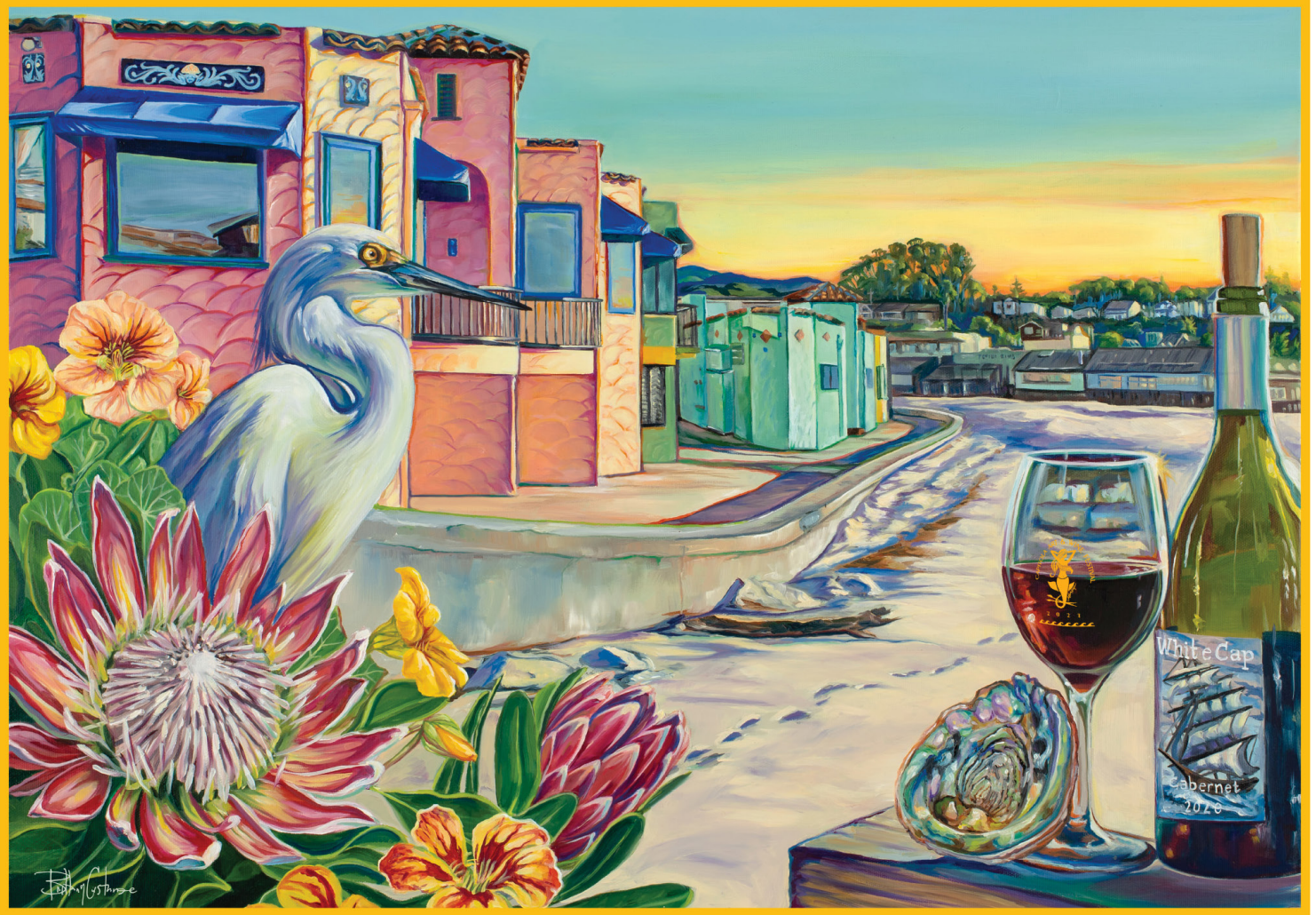
"VENETIAN SUNRISE" BY BRITTANY COSTANZO