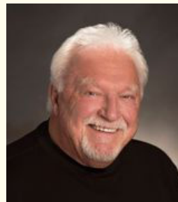
Santa Cruz Homegrown

239 John Street Santa Cruz $1,475,000 605 Pacific Ave.. #302 Santa Cruz $475,000 320 Bridlewood Ct. Santa Cruz $3,100,273 15 Braemoor Dr. Santa Cruz $375,000 906 El Rancho Dr. Santa Cruz $1,325,000 224 Auburn Ave. Santa Cruz $1,750,000 545 38th Avenue Santa Cruz $4,125,000 2909 Branciforte Dr. Santa Cruz $1,450,000 152 Frederick St. Santa Cruz $1,725,000 1200 Capitola Rd. #7 Santa Cruz $820,000 1110 Whitewater Cove Santa Cruz $423,000 217 Sunset Ave. Santa Cruz $2,450,000 229 Pearl St. Santa Cruz $699,000 912 Lundy Lane Scotts Valley $1,450,000 239 Southwood Dr. Scotts Valley $2,100,000 431 Lockwood Lane Scotts Valley $1,080,000 21 Blake Ave. Watsonville $1,203,636 701 Arce Street Watsonville $315,000 61 Beverly Drive Watsonville $855,500 25 Allston Way Watsonville $300,000 1916 East Lake Ave. Watsonville $450,000 141 Pioneer Road Watsonville $3,022,000 293 Sunnyhills Dr. Watsonville $250,000 64 Vista Verde Circle Watsonville $795,000 195 Buzzard Lagoon Rd. Watsonville $520,000 8 Kralj Drive Watsonville $908,000