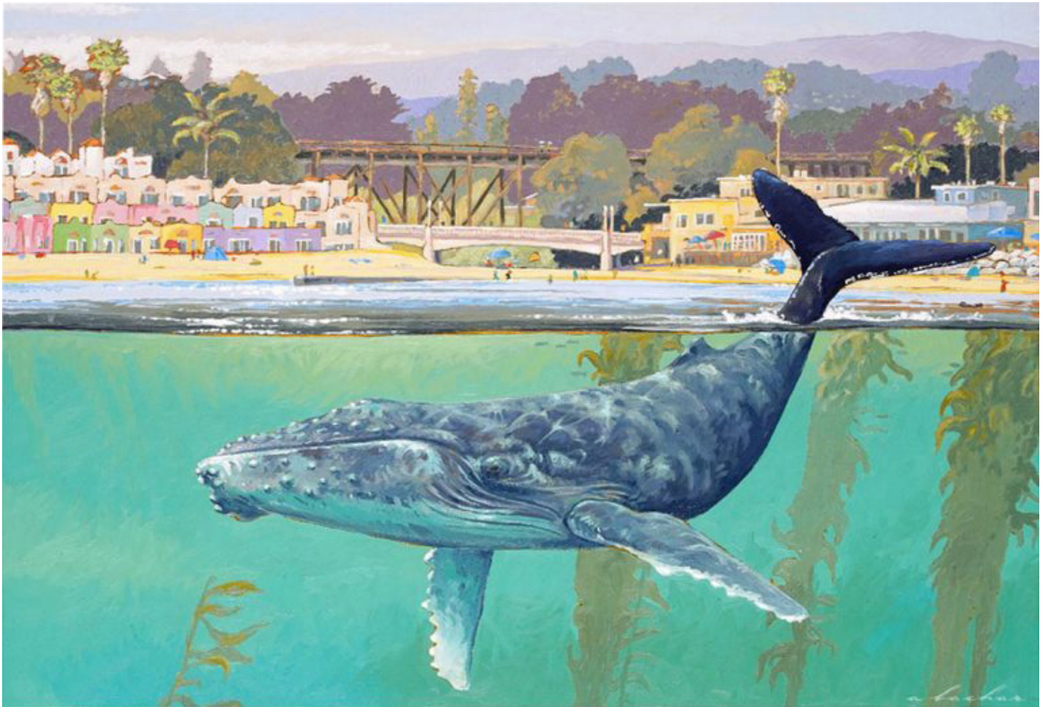
2022 poster art by Amadeo Bachar