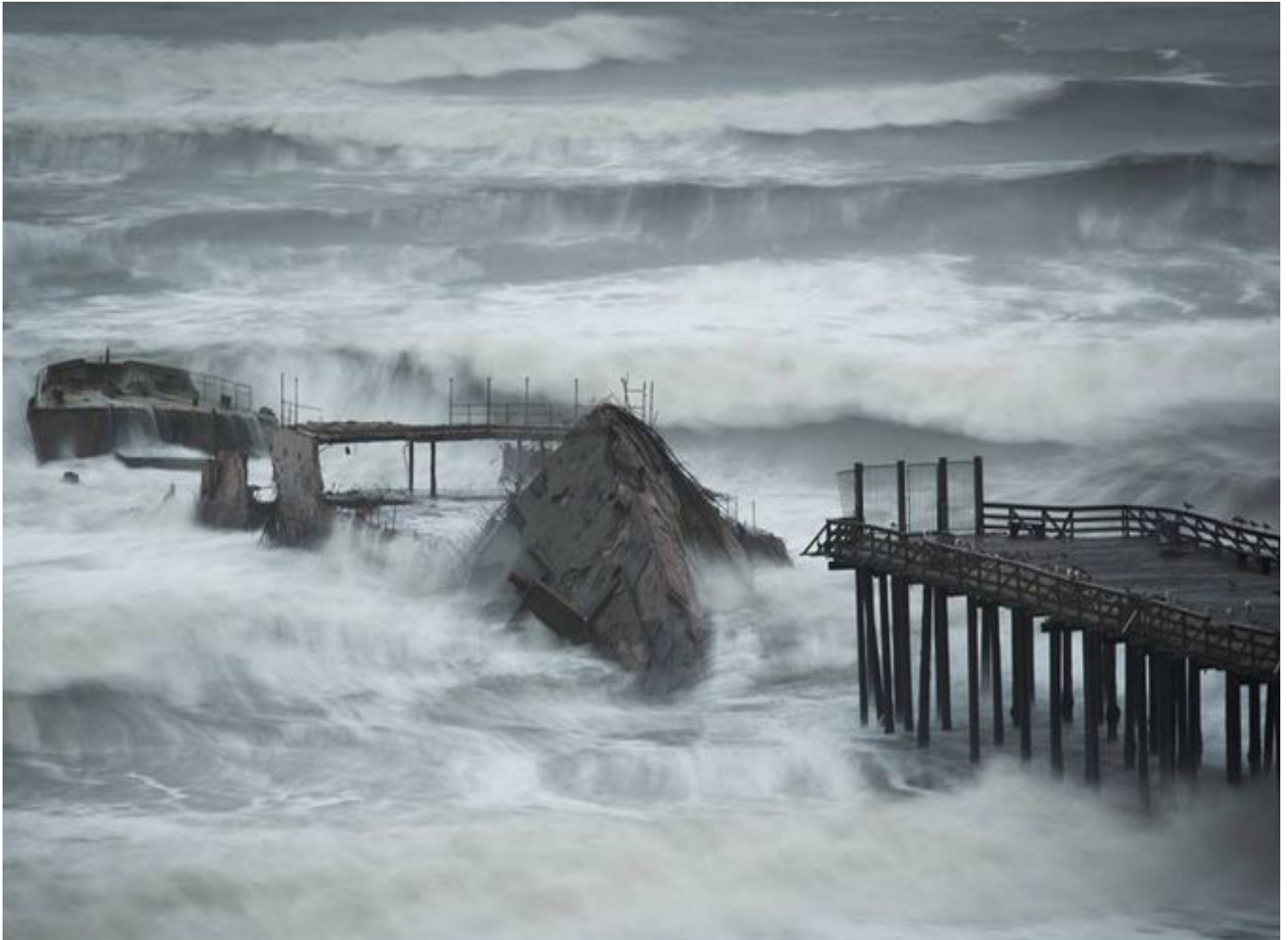
Winter Storm 2017