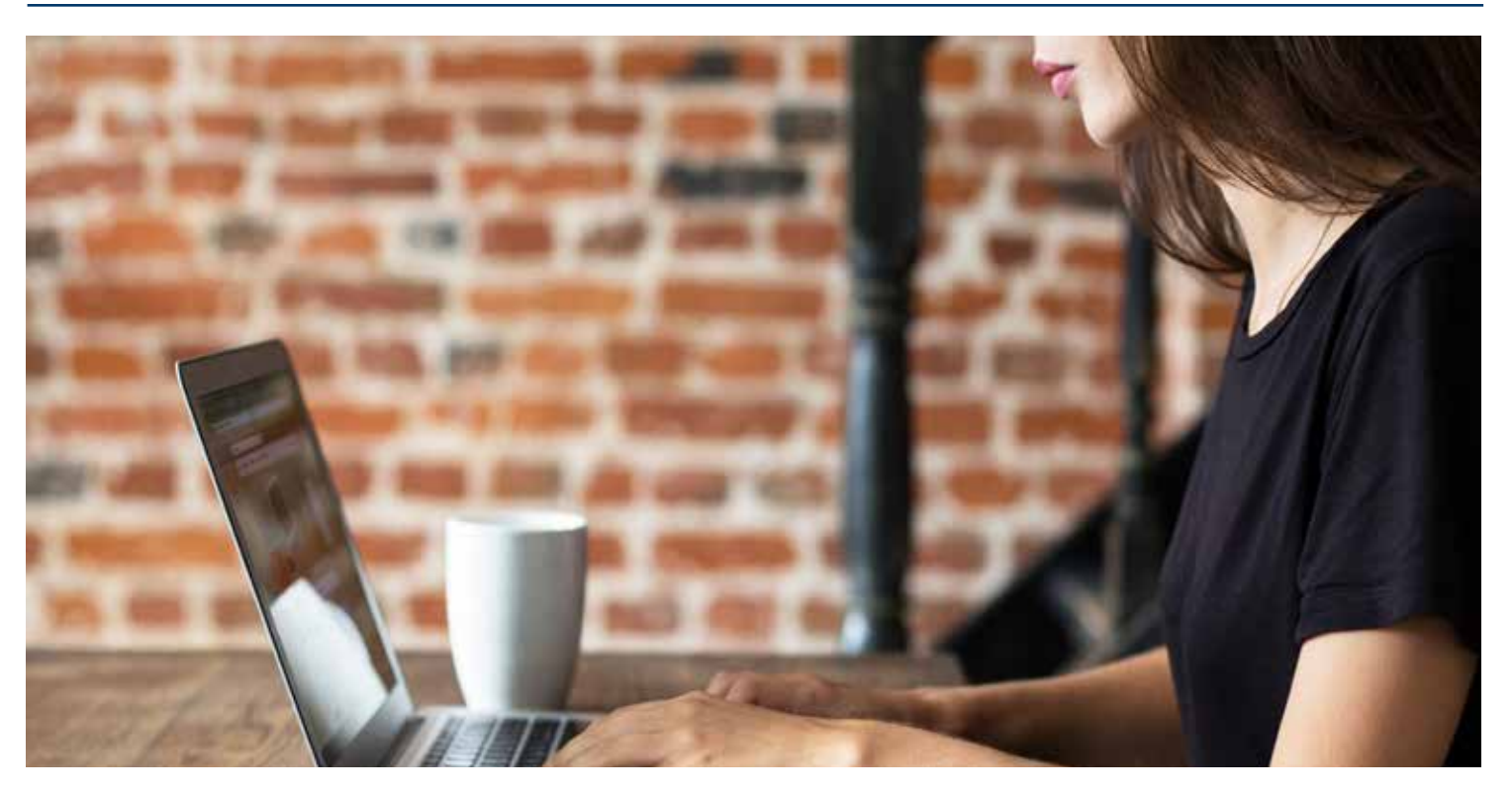
Check out the upcoming Small Business webinars at: SantCruzSBDC.org

Margarita Sotelo Sotelo Happy Kids Day Care Watsonville