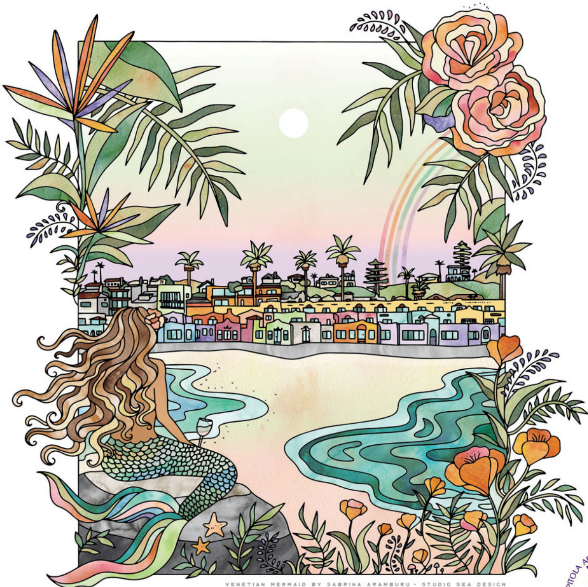
VENETIAN MERMAID BY SABRINA ARAMBURU - STUDIO SEA DESIGN