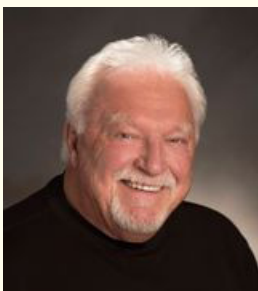
Santa Cruz Homegrown

57 Seascape Resort Drive Aptos 95003 $1,615,000 331 Loyola Drive Aptos 95003 $200,500 266 North Avenue Aptos 95003 $1,065,000 112 Cherry Blossom Lane Aptos 95003 $750,000 7525 Freedom Blvd. Aptos 95003 $12,600,000 227 Highland Drive Aptos 95003 $1,705,000 255 Brooktree Ranch Road Aptos 95003 $2,000,000 9280 Old County Road Ben Lomond 95005 $898,000 911 Valley View Road Ben Lomond 95005 $1,245,000 170 Cottage Avenue Ben Lomond 95005 $800,000 12470 Lorenzo Avenue Boulder Creek 95006 $600,000 120 Riverside Dr. Boulder Creek 95006 $525,000 12106 Love Creek Rd Boulder Creek 95006 $610,000 240 River Drive Boulder Creek 95006 $650,000 15085 Big Basin Way Boulder Creek 95006 $628,000 198 E. Hilton Drive Boulder Creek 95006 $350,000 1066 41st Avenue #A103 Capitola 95010 $748,636 1066 41st Avenue #A101 Capitola 95010 $740,000 870 Park Ave. #309 Capitola 95010 $1,449,000 9409 Zayante Drive Felton 95018 $617,000 10100 Rosebloom Ave. Felton 95018 $550,000 100 Zayante School Road Felton 95018 $1,010,000 322 River Road Felton 95018 $850,000 271 Clearview Place Felton 95018 $1,115,000 12385 Coleman Avenue Felton 95018 $400,000 1941 Freedom Blvd. Freedom 95019 $999,500 50 Hillview Way La Selva Beach 95076 $4,900,000 610 Henry Cowell Drive Santa Cruz 95060 $2,712,000 270 Hidden Lane Santa Cruz 95060 $1,192,000 208 Alamo Avenue Santa Cruz 95060 $1,670,000 161 Eaton Street Santa Cruz 95062 $970,000 542 Ocean Vierw Ave Santa Cruz 95062 $1,085,000