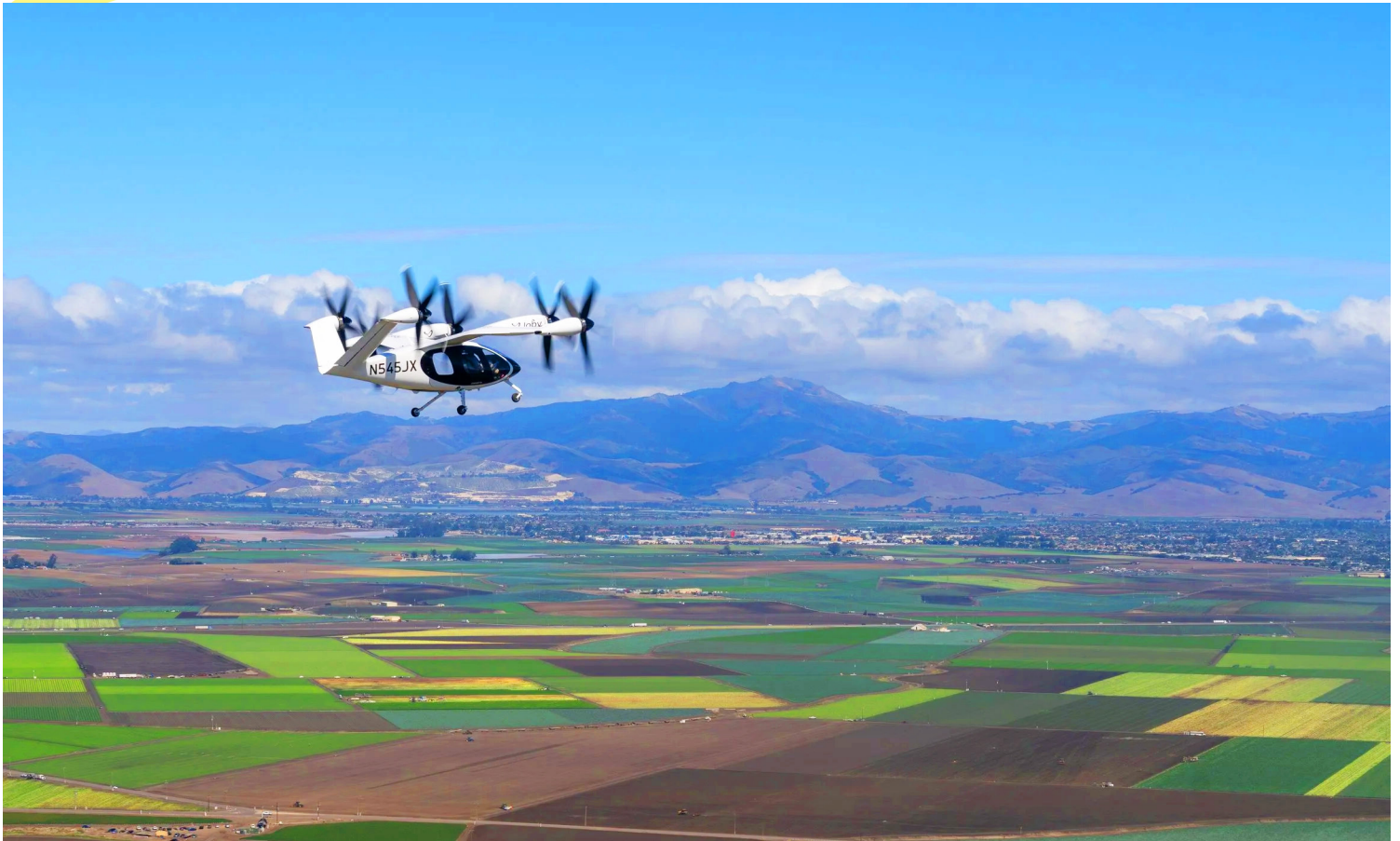
Joby's aircraft flying over Monterey, California with Salinas in the background.