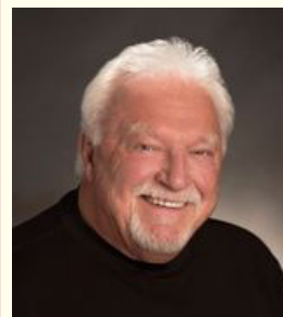
Santa Cruz Homegrown

18869 Rea Avenuye Aromas 95004 $924,545 46480 Clear Ridge Road Big Sur 93920 $5,300,000 39 Del Mesa Carmel Carmel 93923 $1,120,000 27845 Berwick Drive Carmel 93923 $1,100,000 24520 Outlook Dr. #16 Carmel 95023 $1,300,000 25682 Carmel Knolls Dr. Carmel 93923 $1,580,000 226 Highway 1 Carmel 93923 $3,500,000 3721 Raymond Way Carmel 93923 $1,665,000 44 Hacienda Carmel Carmel 93923 $750,000 Guadalupe 4 NW of 1st Carmel 93921 $3,250,000 32 Southbank Road Carmel Valley 93924 $815,000 47103 Arroyo Seco Road Greenfield 93927 $350,000 223 Apple Avenue Greenfield 93927 $600,000 85 Carmona Drive King City 93930 $670,000 772 Livingston Avenue King City 93930 $628,500 50950 Pine Canyon Road King City 93930 $820,000 45130 Crown Avenue King City 93930 $450,000 69487 Interlake Road Lockwood 93932 $725,000 3019 Bayer Drive Marina 93933 $780,000 2810 Telegraph Blvd. Marina 93933 $1,075,000 3080 Arroyo Drive Marina 93933 $1,542,500 2734 Sand Dune Avenue Marina 93933 $1,546,500 2730 Sand Dune Marina 93933 $995,000 2418 Sea Shell Avenue Marina 93933 $1,685,000 1304 Patch Court Marina 93933 $237,500 1706 Eichelberger Circle Marina 93933 $552,500 1271 4th Street Monterey 93940 $1,155,000 447 Bonifacio Place Monterey 93940 $2,200,000 2061 Marsala Circle Monterey 93940 $1,200,000 420 Dela Vina Avenue #7 Monterey 93940 $550,000