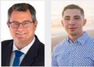
SANTA CRUZ CITY COUNCIL DISTRICT 4 CANDIDATES