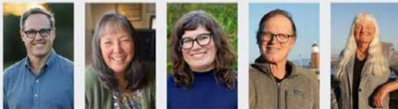
SANTA CRUZ MAYORAL CANDIDATES