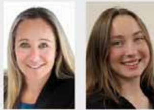
SANTA CRUZ CITY COUNCIL DISTRICT 6 CANDIDATES