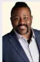
D3 COUNTY SUPERVISOR